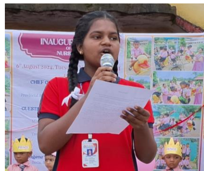
Welcoming the Guests by MCs