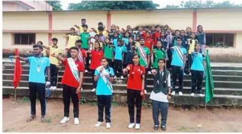
सेंट यूजिन हायर सेकेंडरी स्कूल बोदा इनाॅग्रेसन सेरिमनी में उपस्थित अतिथिगण एवं छात्र

● बतौली छात्रों के द्वारा प्रस्तुत मनमोहन प्रस्तुतियां एवं मुख्य अतिथि एवं छात्र अभिभावकों की उपस्थिति में संपन्न हुई उद्घाटन सेरिमनी आपको बता दें कि सरगुजा जिले के अंतर्गत बतौली विकासखंड के बोदा में स्थित सेंट यूजिंग हायर सेकेंडरी स्कूल में आज नर्सरी सेक्शन का ओपनिंग सेरिमनी का आयोजन किया गया था इस दौरान मुख्य अतिथि तथा छात्र अभिभावकों की उपस्थिति में छात्रों के द्वारा मनमोहन प्रस्तुतियां प्रस्तुत की गई। इस दौरान इस दौरान बीते वर्ष पूर्व वर्तिय कक्षाओं में उत्कृष्ट परिणाम लाने वाले छात्रों को भी पुरस्कृत किया गया। साथ ही बीते कई वर्षों के प्रयास एवं अथक मेहनत के द्वारा ही इस स्कूल को आज हायर सेकेंडरी से लेकर नर्सरी तक संचालित किया जा रहा है इस संदर्भ में उपस्थित पूर्व में पदस्थ प्राचार्यों के द्वारा प्रकाश डाला गया। साथ ही साथ ही नवनिर्वाचित शाला नायक एवं विभिन्न कक्षाओं के छात्र नायकों ने शपथ ग्रहण भी किया। इस दौरान मुख्य अतिथियों को सेंट यूजिंग हायर सेकेंडरी स्कूल कि बीते वर्षों की यादों समेटे हुए एक किताब का भी उद्घाटन किया गया। इस दौरान छात्र पालक संघ के अभिभावक मुख्य अतिथि छात्र एवं शिक्षक गण उपस्थित थे।