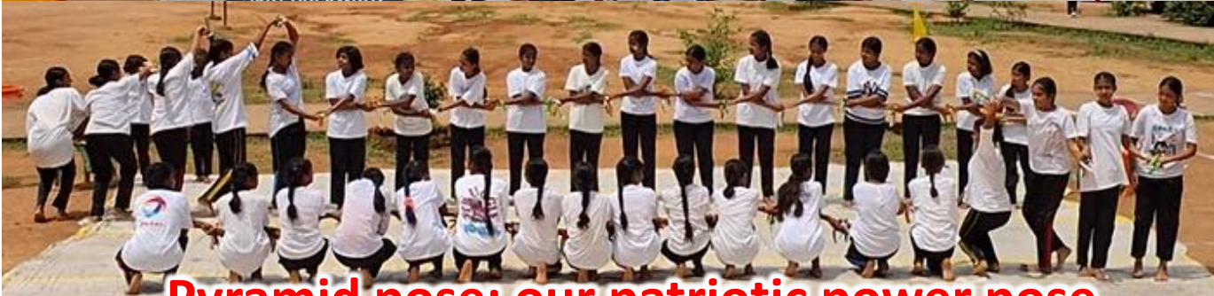
Pyramid pose: our patriotic power pose