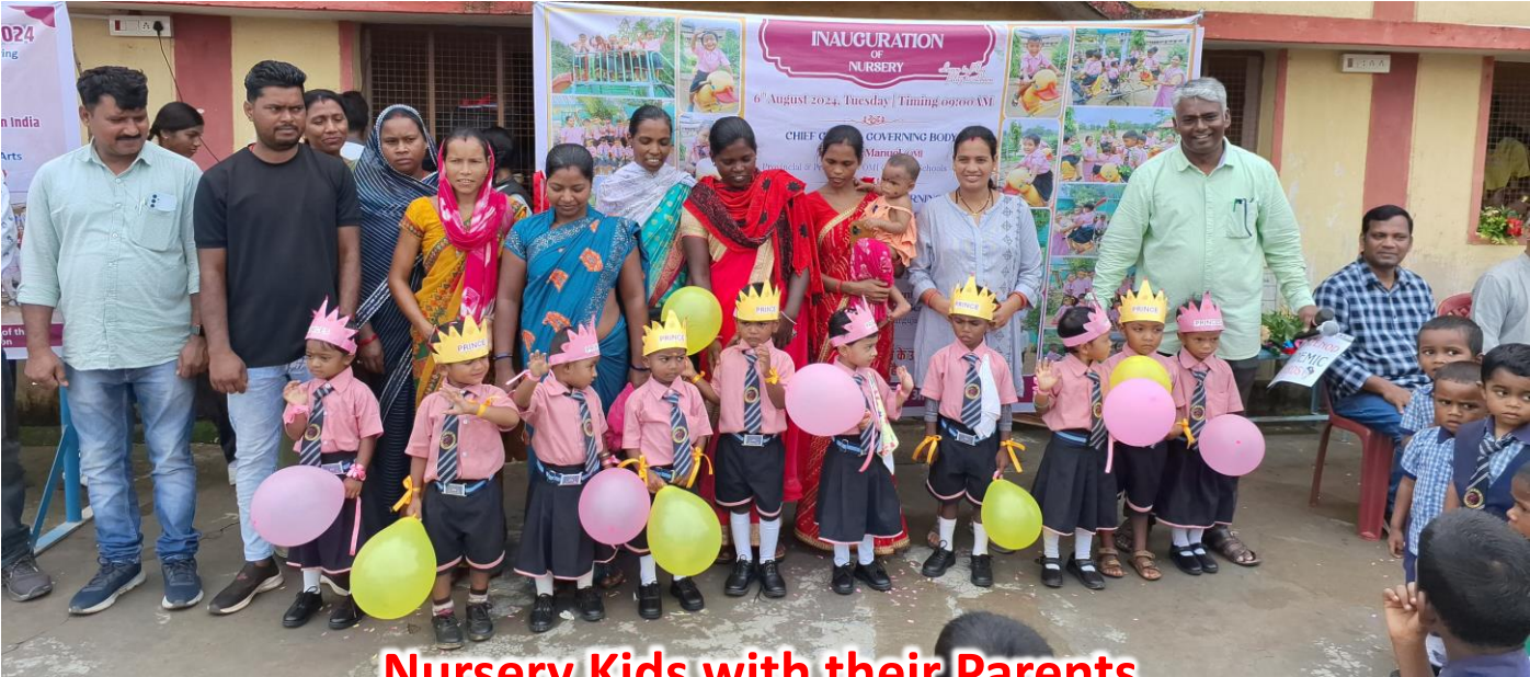
Nursery Kids with their Parents