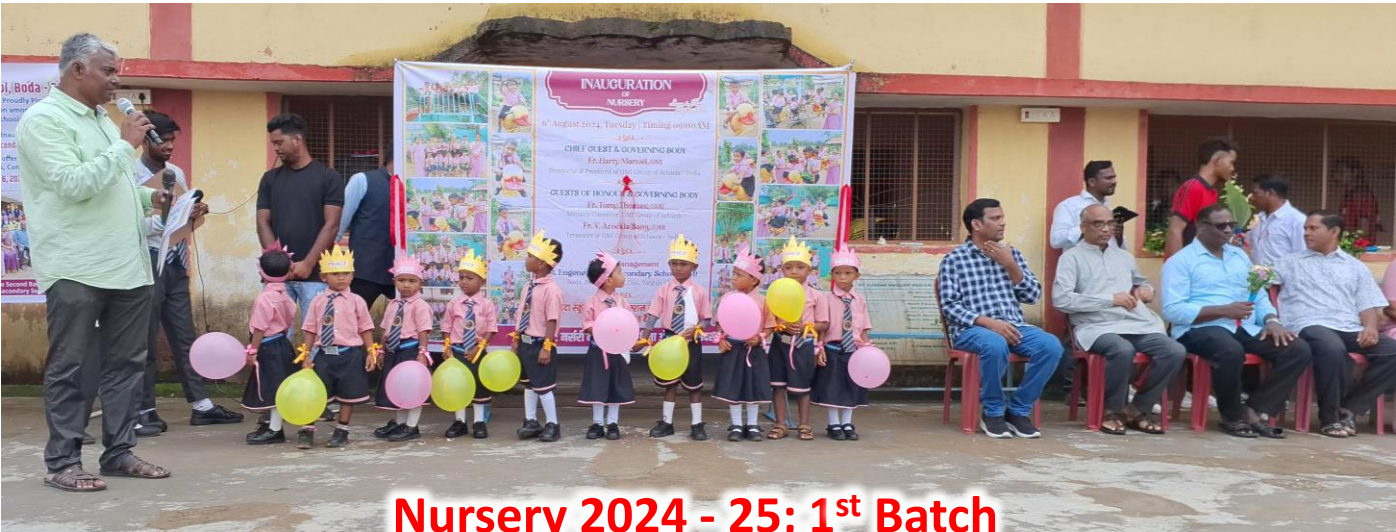
Nursery 2024 - 25; 1 st Batch