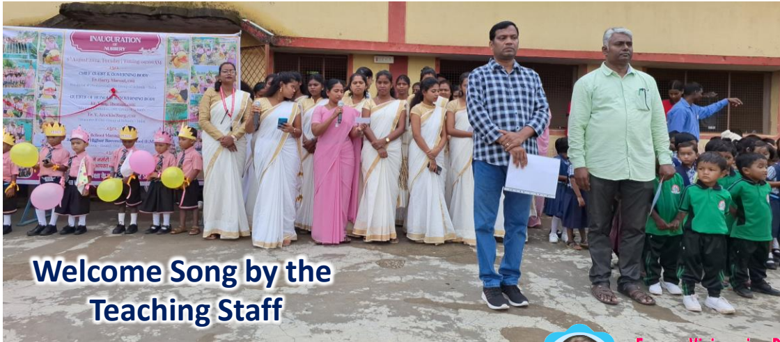
Welcome Song by the Teaching Staff