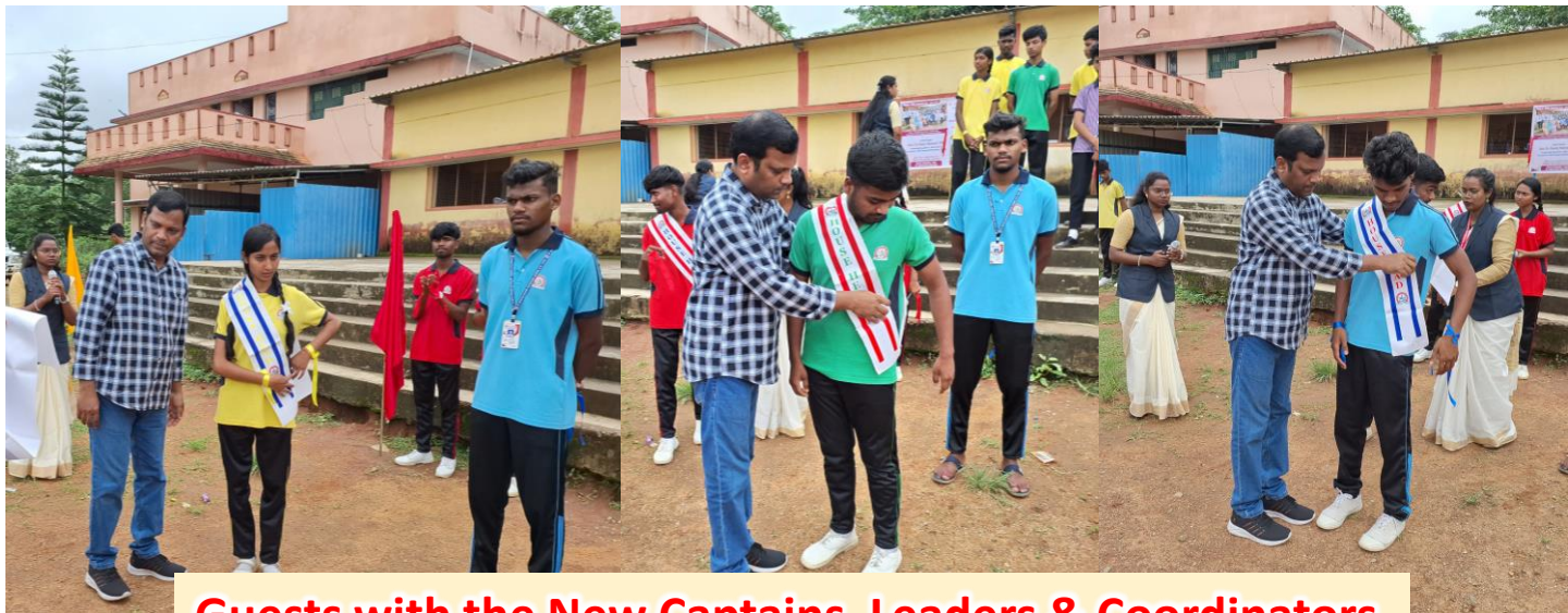
Guests with the New Captains, Leaders & Coordinators

The Chief Guest honouring the House Captains - dt. 6 th August 2024